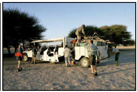
Days 7, 8 & 9: Camping, Chobe National Park (full board)

Travel time: Moremi – Savuti Approx - 120km. 5-6 hrs (incl game viewing)